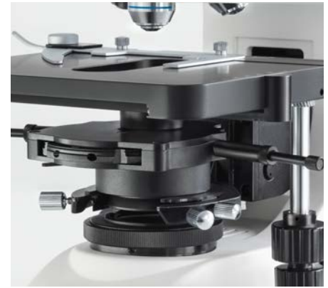
OBN-15: Mounted phase contrast condenser